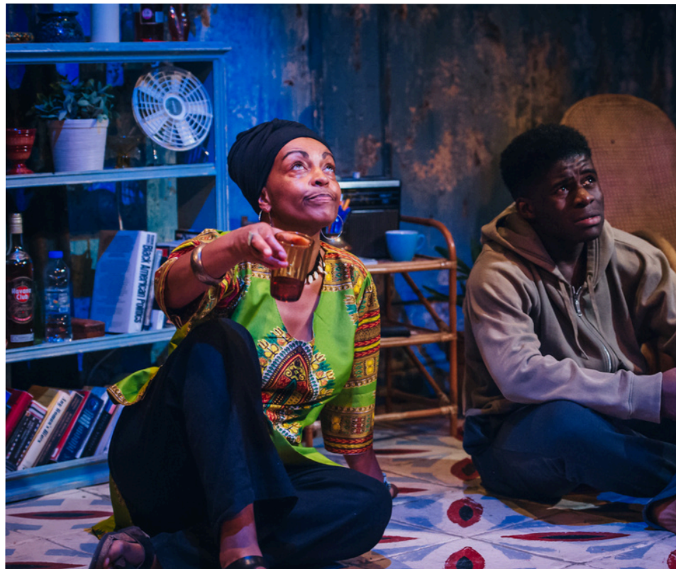
Assata Taught Me (2017)