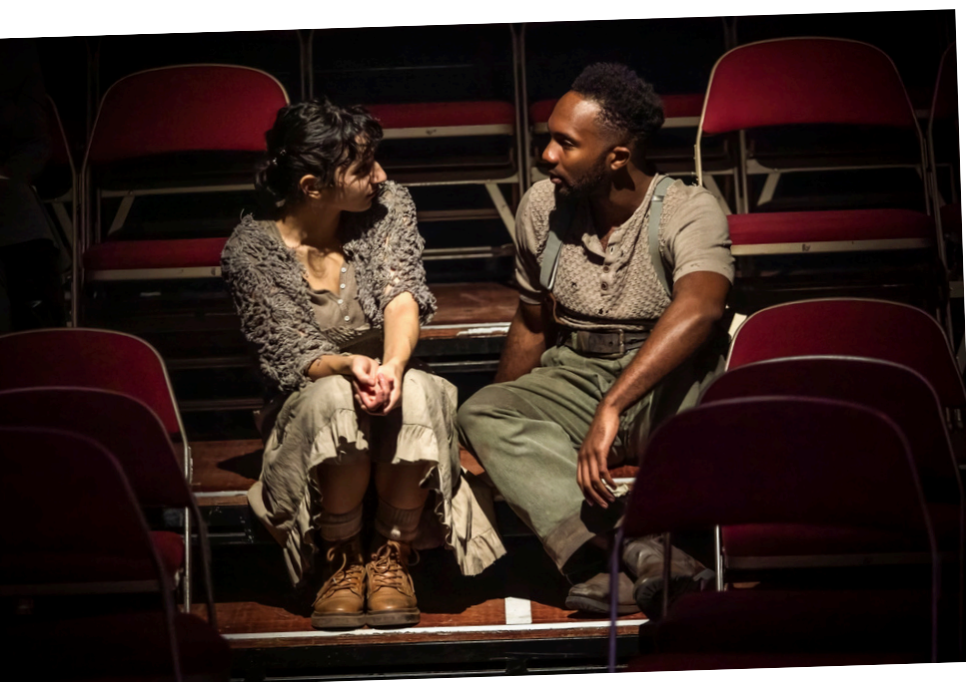
A Sudden Violent Burst of Rain (2022)