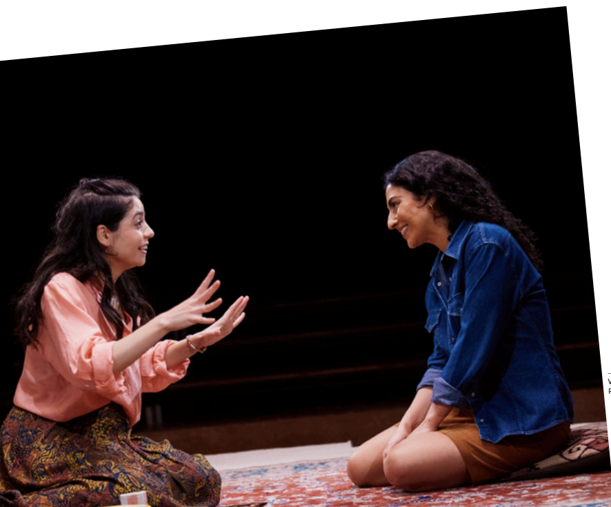
Wish You Were Here (2024)