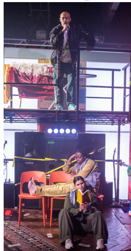
Brassic FM (2023)

We believe that everyone should have access to exceptional stories, creative activities and a platform for expression. We prioritise international voices as a means to diversify and enrich the conversation on our stages. Access to theatre and the arts is an inalienable human right. At the Gate, the work should be an opportunity for social change and provocation to think deeply. Through this, we have the opportunity to imagine society differently.