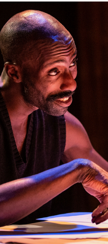
Dear Elizabeth (2021)

We interrogate established ways of working, recognising that theatre is implicitly political and social and we must make work that responds to and engages with the context. Through creativity, care and accessibility, we can make challenging work while considering more sustainable models of theatremaking. We call this our 'slow theatre' approach, where work is generated while we support artists in long-term development.